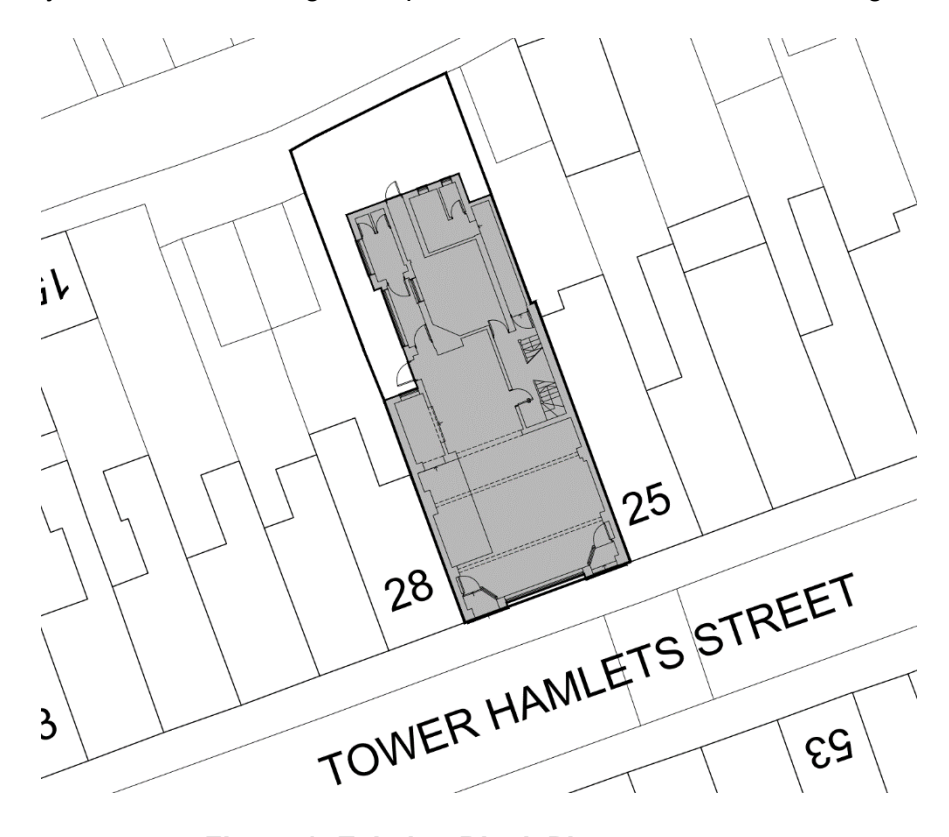
Figure 1: Existing Block Plan

1.1 The application site relates to a two-storey terraced property set to the northwest of Tower Hamlets Street, set within the settlement confines of Dover. The property is currently a Public House (pub) but has ceased trading. The property is not listed, is not within a Conservation Area, nor is it within the setting of these constraints and is not within a Flood Zone. In addition, the pub is not listed as an asset of community value. The existing block plan of the site is shown below in Figure 1.