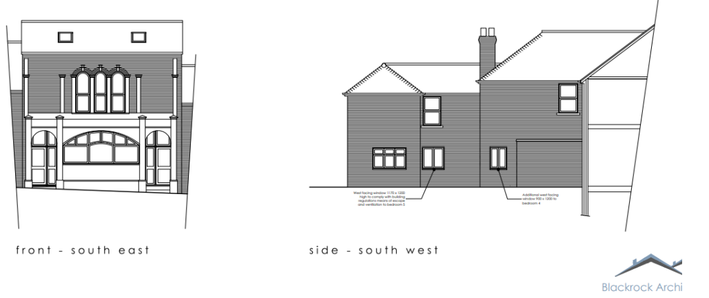
Figure 4: Proposed Front Elevation