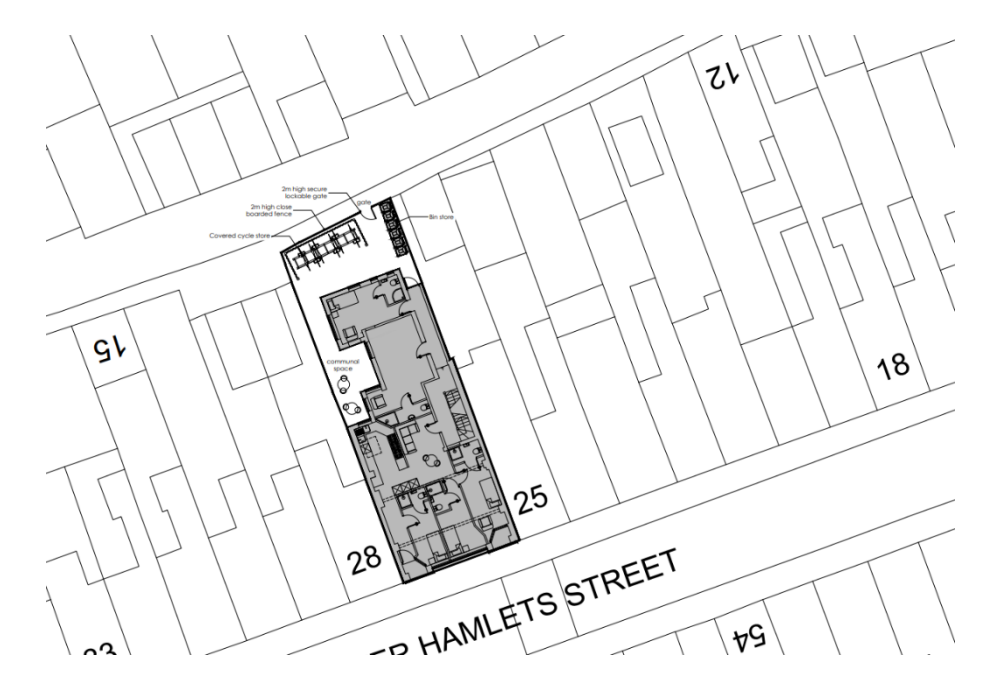
Figure 2: Proposed Block Plan